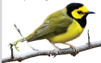
Chestnut-sided Warbler photo by David Wendelken Hooded Warbler photo by David Wendelken Painted Trillium photo by Lynn Cameron Braley Pond photo by Lynn Camero

Please bring a mask to wear in the table area. No need for masks when families are exploring on their own.